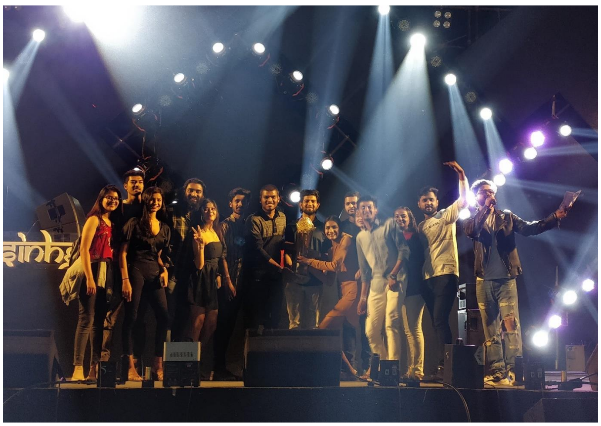
'SINHGAD KARANDAK Overall Championship'