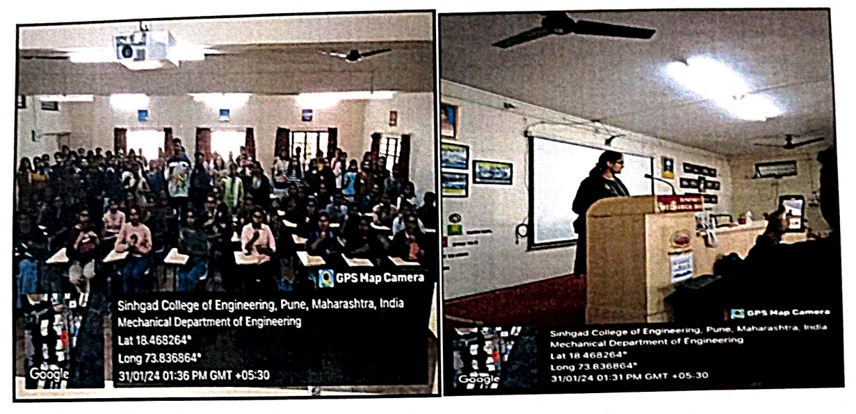
Fig. Girls Student with Guest and student feedback talk.