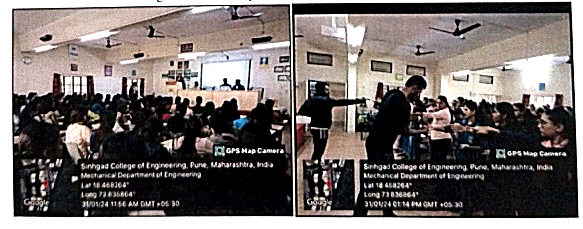
Fig. Guest talk and self-defense training session.